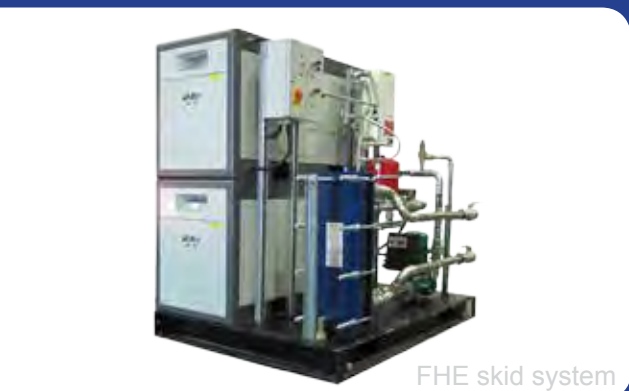
FHE skid system