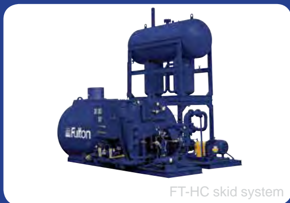
FT-HC skid system

Provided in association with Fulton Thermal Corporation in the USA. Operating temperatures of up to 345 °C.