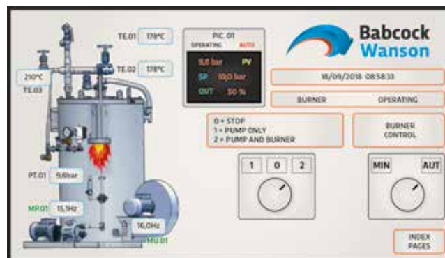
Fully modulating control with HMI