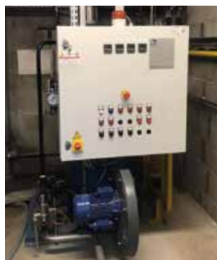
600 kg/h Unit