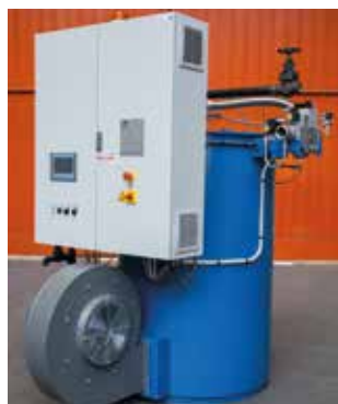
1200 kg/h Unit