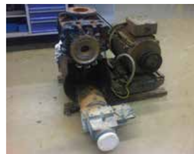
Image 3: Burnt compressor system after sparking occurred in the blower