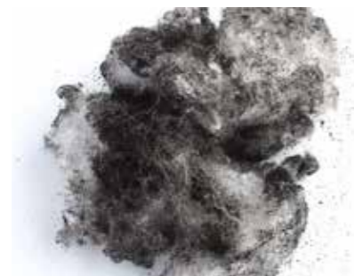
Figure 1: Deposits in bulk material, which collect in silencers with absorption material

With this certification for all machines (Delta Blower, Delta Hybrid, Delta Screw), Aerzener Maschinenfabrik GmbH takes an important step towards the quality assurance of oil-free operating air as used for the generation of compressed air within various processes and applications in the aforementioned industries.