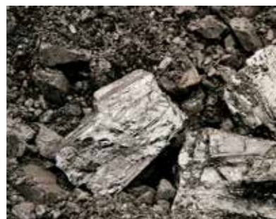
Figure 2: Bulk goods contaminated with oil during the pneumatic conveying process