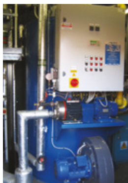
1500 kg/h Unit