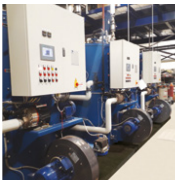
3 x 2000 kg/h Units